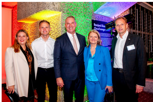
Out Leadership's Europe Summit 2024, VIP Reception, Barbican Centre