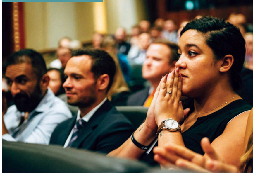
Participants at OutNEXT's 2018 Global Summit