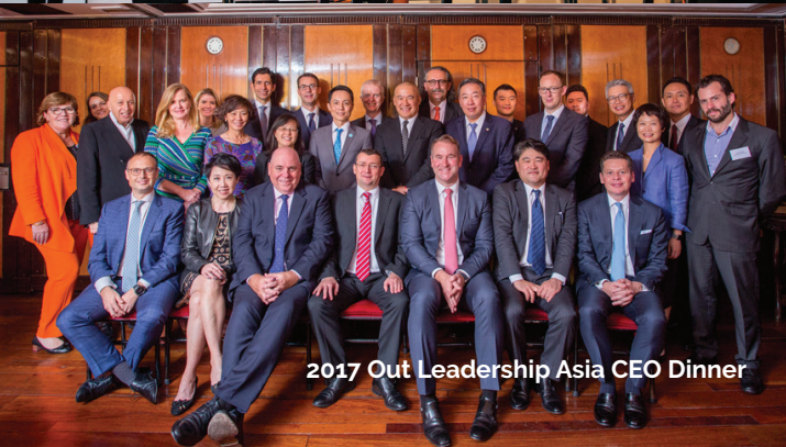
2017 Out Leadership Asia CEO Dinner