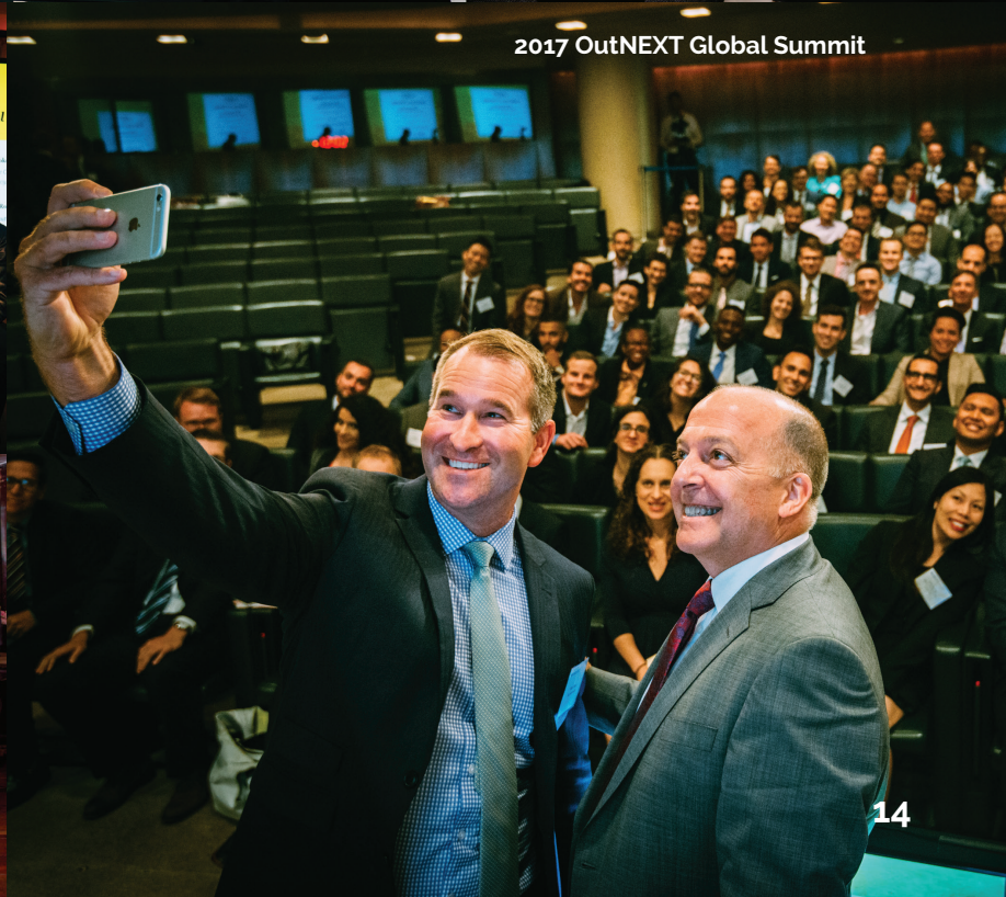
2017 OutNEXT Global Summit