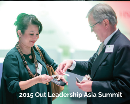
2015 Out Leadership Asia Summit