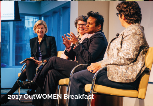
2017 OutWOMEN Breakfast