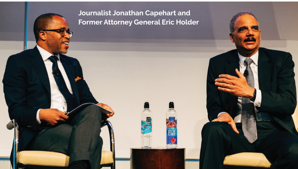
Journalist Jonathan Capehart and Former Attorney General Eric Holder

To generate a Return on Equality™, we provide global business with the tools for innovation and transformation. Through our summits, talent accelerators and strategic insights, we've earned the trust of influential CEOs by helping them realize the returns of equality.