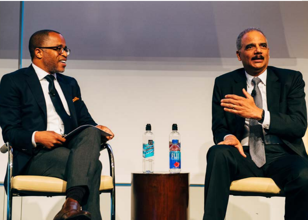
Jonathan Capehart, The Washington Post, and Eric Holder, 82nd Attorney General of the United States, at Out Leadership's 2017 U.S. Summit

We work closely with all our summit sponsors to create agendas and conversation starters important to them, providing speaking roles and prominent visibility for their senior leadership.